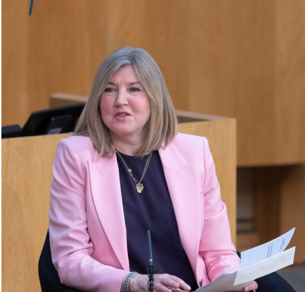
Alison Johnstone, MSP and Presiding Officer