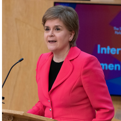
Rt. Hon. Nicola Sturgeon, Former First Minister of Scotland