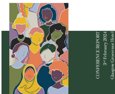
The Scottish Women's Convention What Should Childcare Look Like in Scotland?

'What Should Childcare Look like in Scotland?' Conference Report