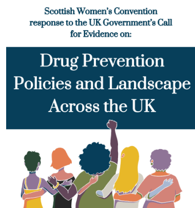
UK Government Call for Evidence - Drug Prevention Policies and Landscape Across the UK Consultation Response