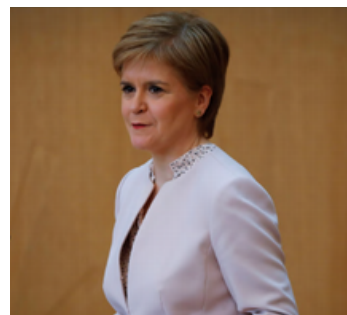
RT.HON. NICOLA STURGEON MSP, FIRST MINISTER OF SCOTLAND