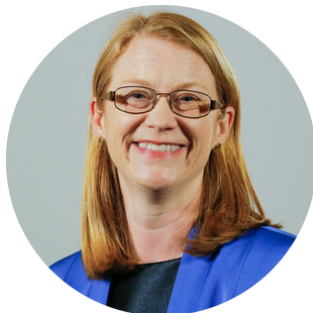
SHIRLEY-ANNE SOMERVILLE MSP, CABINET MINISTER FOR EDUCATION