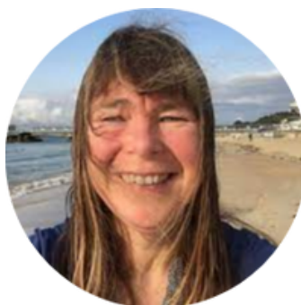
ALISON JOHNSTONE MSP, CO-LEADER OF THE GREENS IN SCOTTISH PARLIAMENT